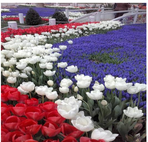
Stunning tulips - Istanbul

The Rock Carved Al Deir (Monastery) Petra