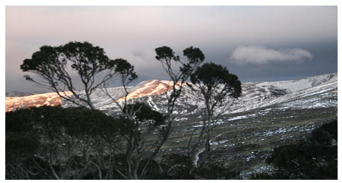
May,2016 Charlotte Pass, KNP

Yoga is Union. Union with whom or what, is interpreted differently in different cultures. In India it was Ishwara or the Atman and variously described as The Higher Self, God, or Cosmic Consciousness. For some these days it is union with physical fitness along with a smattering of calmness and peacefulness.