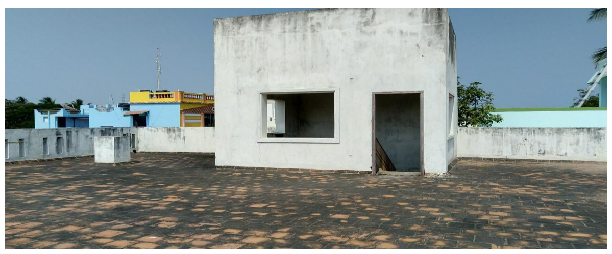
Rooftop area for classes