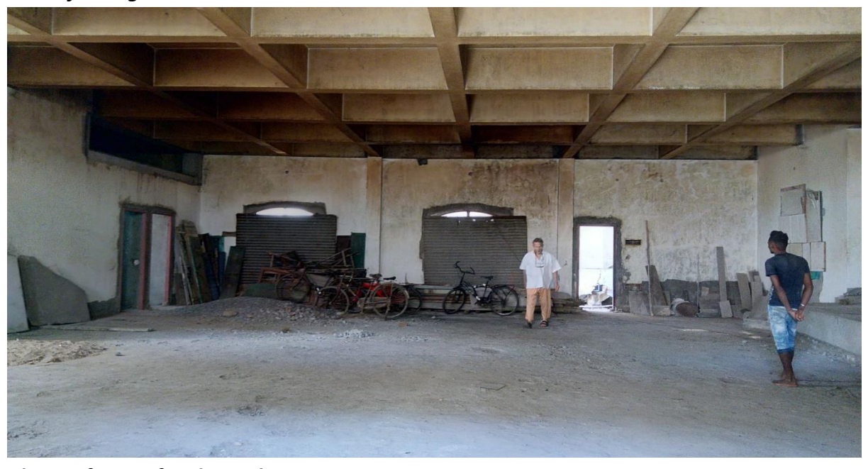
Plenty of space for classes here