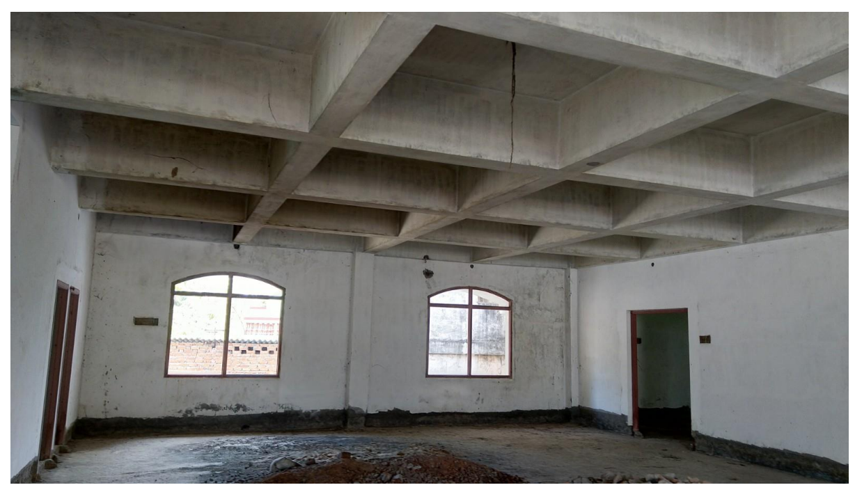
Top floor Interior view above and below