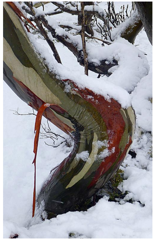
Snowgum in the snow